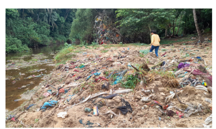
Dumped waste near the river bank.

River channels and streams are being straightened, widened, channelized or piped to fix water flow and encroach banks for construction. The concrete channel provides no ecological or aesthetic value and leads to a narrowed stream which causes flooding in monsoon.